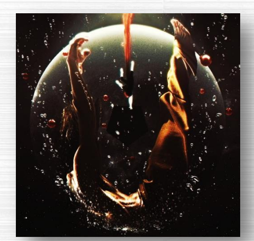
La Partition - LP