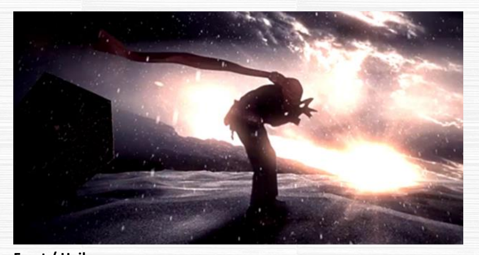
Frost / Hail www.youtube.com/watch?v=Z38EuVhXzZ8 2012, Igor Omodei