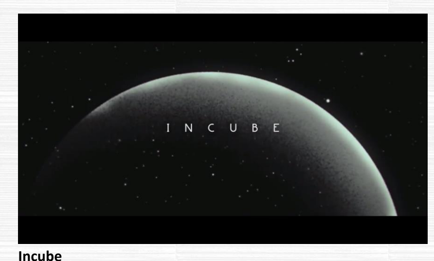
https://www.youtube.com/watch?v=ndjjcEqRpRQ 2017, Igor Omodei